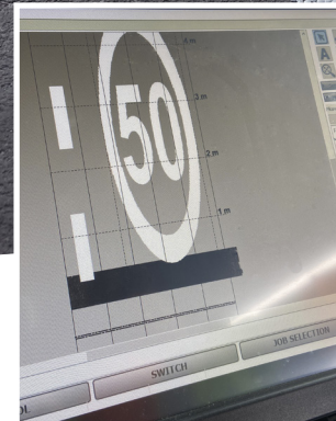
Advanced operating system.